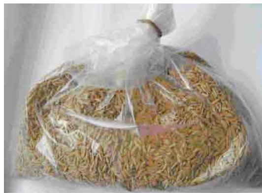
Hermetically sealed SuperGrainbag with paddy seeds.

Resistance – Very strong material (see back), low moisture and oxygen permeability, infesting insects use oxygen and die. SuperGrainbags are normally used as a liner inside polypropylene woven jute or equivalent protective bag. Smaller bags can be used without outer bag.